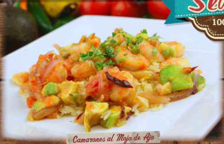
Camarones al Mojo de Ajo