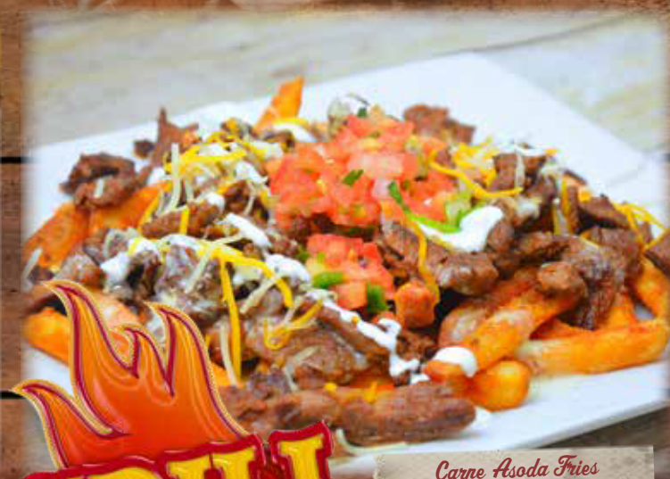
Carne Asada Fries