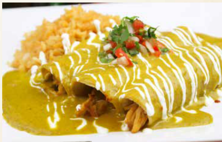
Enchiladas Bang Bang

*NOTICE: COOKED TO ORDER CONSUMING RAW OR UNDERCOOKED MEATS, POULTRY, SEAFOOD, SHELLFISH OR EGGS MAY INCREASE YOUR RISK OF FOOD BORNE ILLNESS, ESPECIALLY IF YOU HAVE CERTAIN MEDICAL CONDITIONS