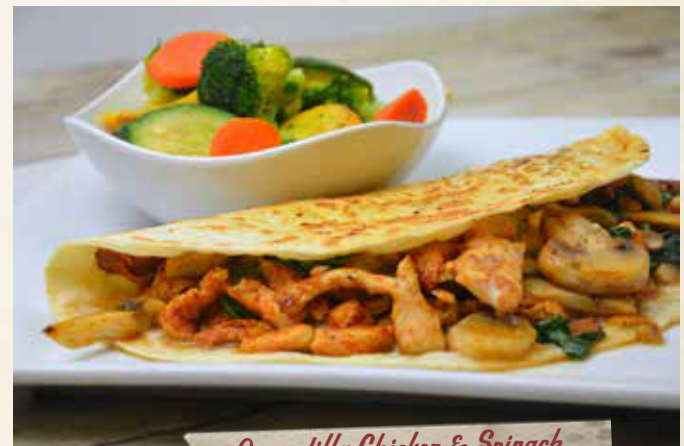
Quesadilla Chicken & Spinach

A large cheese quesadilla stuffed with grilled chicken cooked with sautéed onions, and bell peppers, served with lettuce, tomato and sour cream. $11.99 Steak or shrimp add $1.00