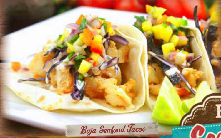
Baja Seafood Tacos