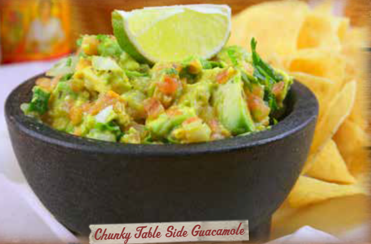
Chunky Table Side Guacamole