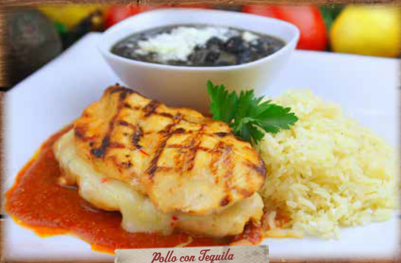
Pollo con Tequila