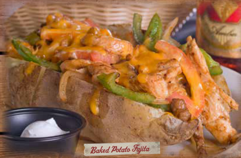
Baked Potato Fajita