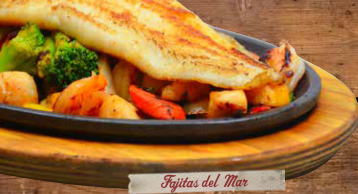
Fajitas del Mar