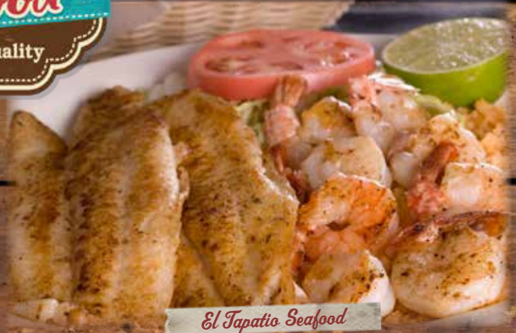
El Tapatio Seafood