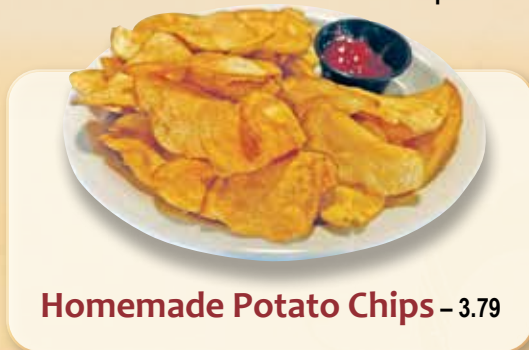
Homemade Potato Chips – 3.79

Your choice of potato chips or French Fries.