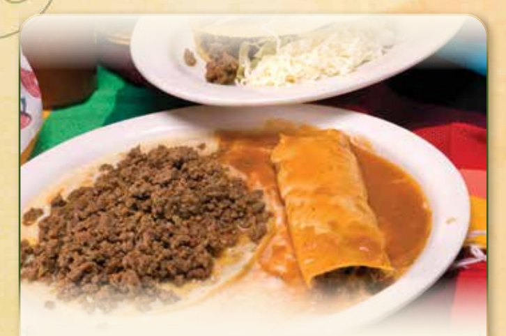
Combination #3 Two tacos, enchilada and chile con carne – 10.89

Huge chimichanga stuffed with your choice of steak or grilled chicken, cooked with onions, bell peppers and tomatoes. Served with rice, beans and a Mexican salad – 12.99 With shrimp, add 3.00